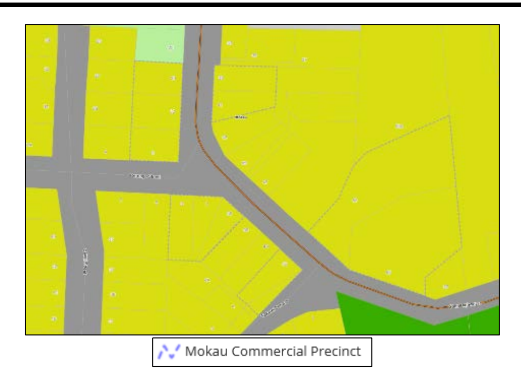
SETZ - Table 3 - Activities Rules - Mokau commercial precinct (PREC4)